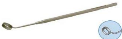
Art.-No.: AO-R-42 (Single use)

Liquid holding well for alcohol application during surgery