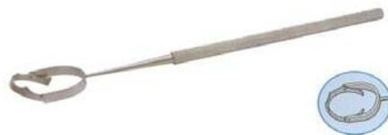
Art.-No.: AO-G-13 (Single use)