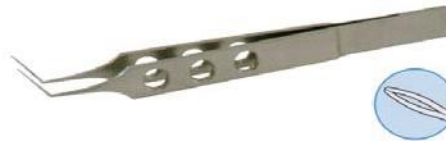
Art.-No.: AO-C-52 (Single use)

45° angled straight shafts. Tip to angled length 14,0mm Used to perform continuous tear circular or oval capsulatomies