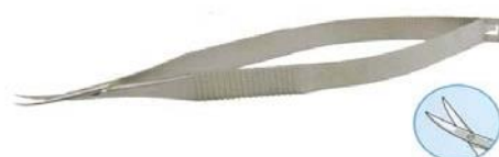
Art.-No.: AO-A-11 (Single use)

Straight shafts with 4,5 mm tying platforms