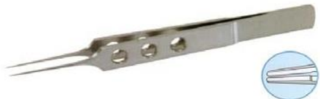
Art.-No.: AO-C-71 (Single use) 105 mm