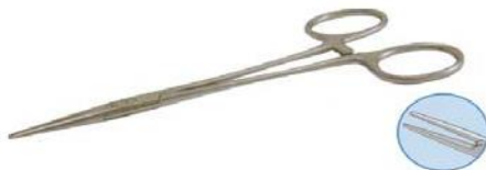
Art.-No.: AO-G-02 (Single use)

Caliper measures from 0mm to 20mm in 0,5mm increments with scale reading on one side