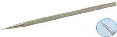
Art.-No.: AO-PD-02 (Single use)