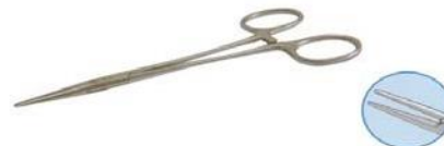
Art.-No.: AO-G-02 (Single use) 12,5 cm