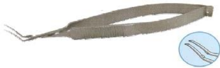
Art.-No.: AO-C-33 (Single use)