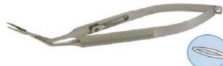
Art.-No.: AO-C-53 (Single use)