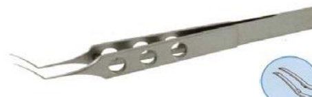
Art.-No.: AO-C-32 (Single use) 105 mm

1 into 2 teeth, with 5,0mm tying platforms