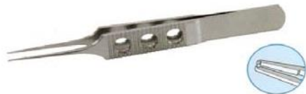
Art.-No.: AO-C-55 (Single use) 85 mm