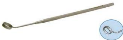
Art.-No.: AO-R-41 (Single use)

Traget center to facelitate accurate marking of the cornea