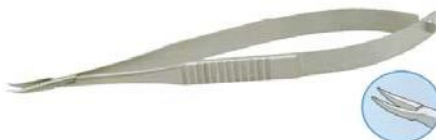
Art.-No.: AO-C-61 (Single use)