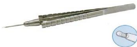
Art.-No.: AO-G-03 (Single use)