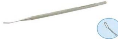
Art.-No.: AO-R-51 (Single use)

Liquid holding well for alcohol application during surgery