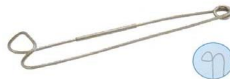
Art.-No.: AO-G-09 (Single use)

Bullet shaped tip for easy insertion into sclero-corneal tunnel