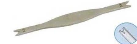
Art.-No.: AO-G-04 (Single use)

Blunt tipped forceps for manipulating the conjunctiva