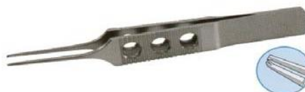
Art.-No.: AO-C-54 (Single use) 85 mm