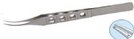
Art.-No.: AO-C-50 (Single use) 115 mm