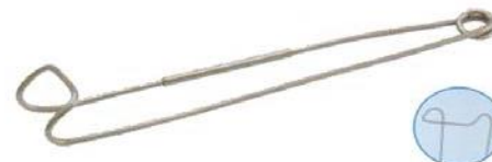
Art.-No.: AO-G-08 (Single use)