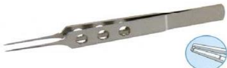
Art.-No.: AO-C-49 (Single use) 115 mm

To implant the folded intra-ocular implant into the capsular bag.