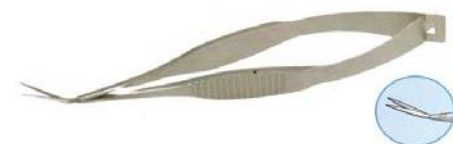
Art.-No.: AO-C-80 (Single use)

Angled 45° shafts with 4,5 mm tying platforms for tying knots and also manipulation of intra-ocular lens