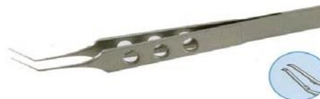
Art.-No.: AO-C-30 (Single use) 85 mm

Straight shafts with 4,5mm tying platforms