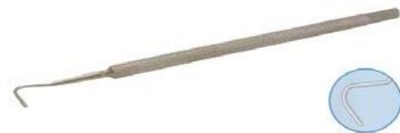
Art.-No.: AO-G-11 (Single use)