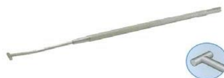
Art.-No.: AO-C-24 (Single use)