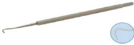
Art.-No.: AO-G-10 (Single use)