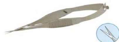
Art.-No.: AO-C-81 (Single use)