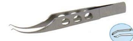
Art.-No.: AO-C-20 (Single use) 85 mm

45° angled straight shafts. Tip to angled length 14,0mm Used to perform continuous tear circular or oval capsulatomies