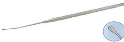
Art.-No.: AO-C-23 (Single use)