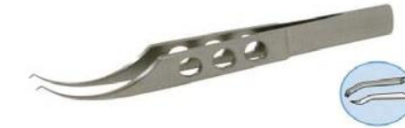
Art.-No.: AO-C-22 (Single use) 105 mm

Blunt tipped forceps for manipulating the conjunctiva.