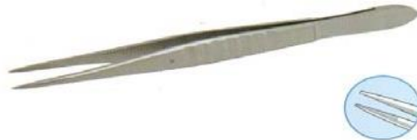
Art.-No.: AO-A-12 (Single use)