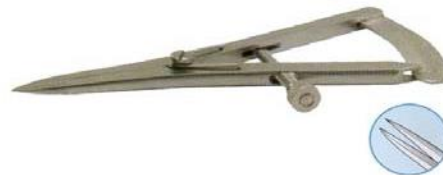
Art.-No.: AO-G-05 (Single use)