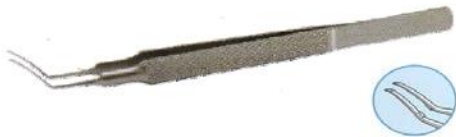
Art.-No.: AO-C-34 (Single use)

Folding 5-6mm sized optics of intra-ocular lenses (IOL). Paddle style jaws with handle stop to prevent over-folding.