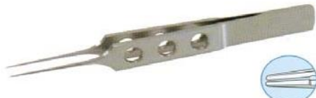
Art.-No.: AO-C-19 (Single use) 85 mm

1 into 2 teeth, 0,12mm with tying platforms