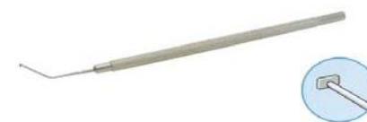
Art.-No.: AO-R-61 (Single use)

For manipulating the epithelium in lasek procedures