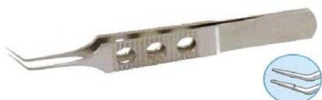
Art.-No.: AO-C-73 (Single use)