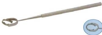
Art.-No.: AO-G-12 (Single use)