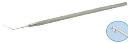
Art.-No.: AO-G-15 (Single use)