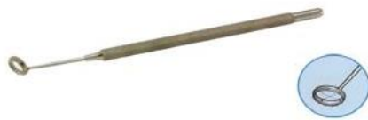
Art.-No.: AO-R-40 (Single use)