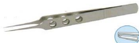
Art.-No.: AO-C-21 (Single use) 100 mm

45° angled straight shafts. Tip to angled length 14,0mm Used to perform continuous tear circular or oval capsulatomies